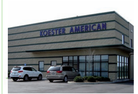
KOESTER American Corporation is headquartered in Virginia Beach, Virginia