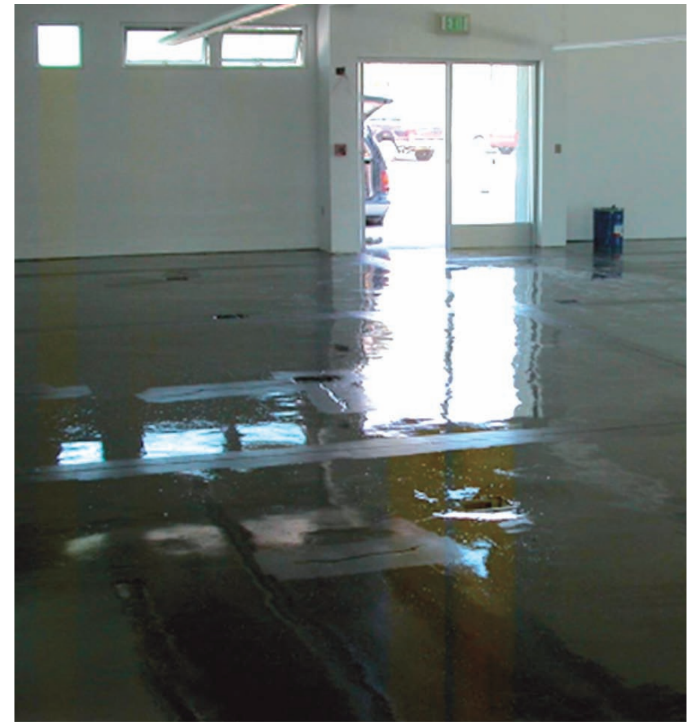
Finished VAP-I® 2000 Project

It is not necessary to broadcast sand into the KÖSTER moisture mitigation system epoxies or subsequently afterward to achieve adhesion with additional flooring materials.