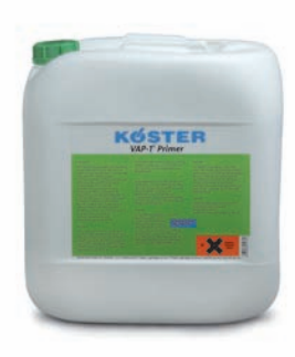
KÖSTER VAP-1® 06 Primer

Just ask any installer what their biggest complaint with nonporous substrate primers is and you will hear, "Time and money." Let's face it; most non-porous substrate primers worth using have always been the 2-component epoxy based systems.