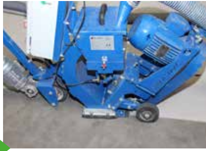
2. Floors and screeds must also be shot blasted or grinded to roughen the surface and produce an open pored, absorptive surface.