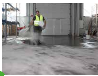
8. Broadcast dried silica sand into the wet primer (only when primed with KÖSTER CT 121) to increase the bond strength of the subsequent layer.