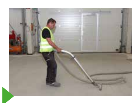
9. After curing, surplus material is removed by vacuum cleaning.