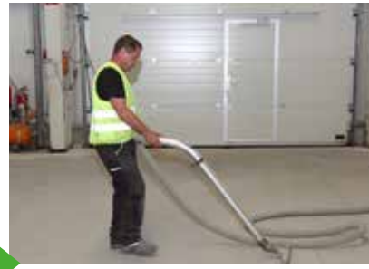
5. To enhance bonding performance all dust and loose particles are removed by vacuum cleaning.