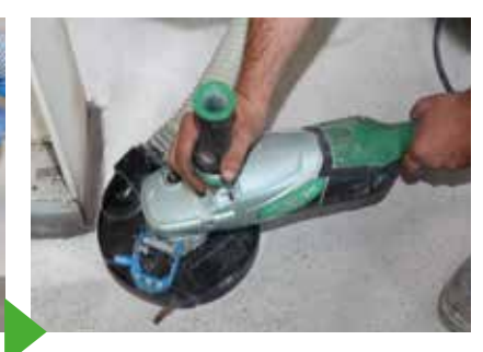
3. Details such as corners and edges have to be prepared by mechanical grinding.