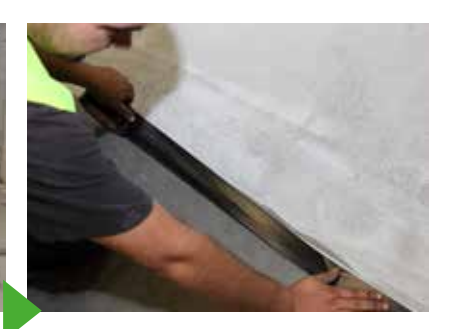
6. Joints and the edges of the work area are taped off to achieve straight edges and to keep the area clean.