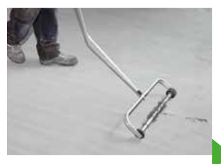
4. When shot blasting is performed with steel abrasive, the surface is cleaned with a magnetic broom. The collected shot can be re-used.