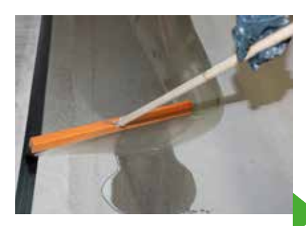
7. KÖSTER CT 121 is used as a primer. Substrates with high vapor drive must be sealed with KÖSTER VAP 2000.